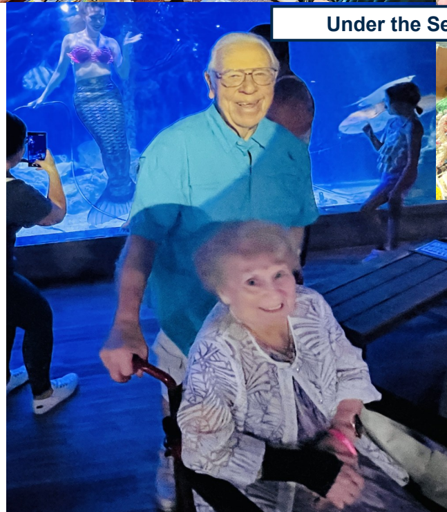
Under the Sea