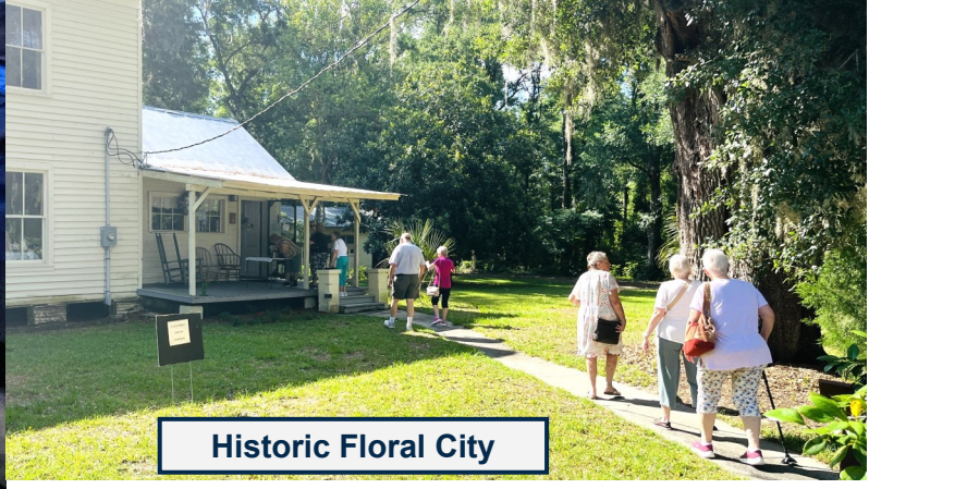
Historic Floral City